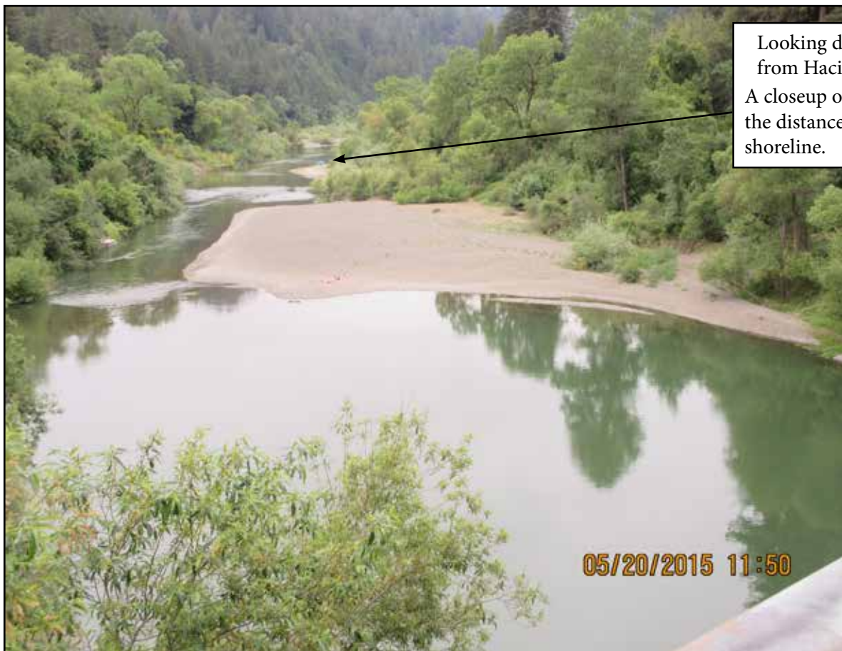
Looking downstream from Hacienda Bridge A closeup of the blue gazebo in the distance shows growth at shoreline.