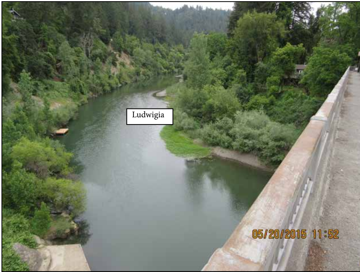
Looking upstream from Hacienda Bridge