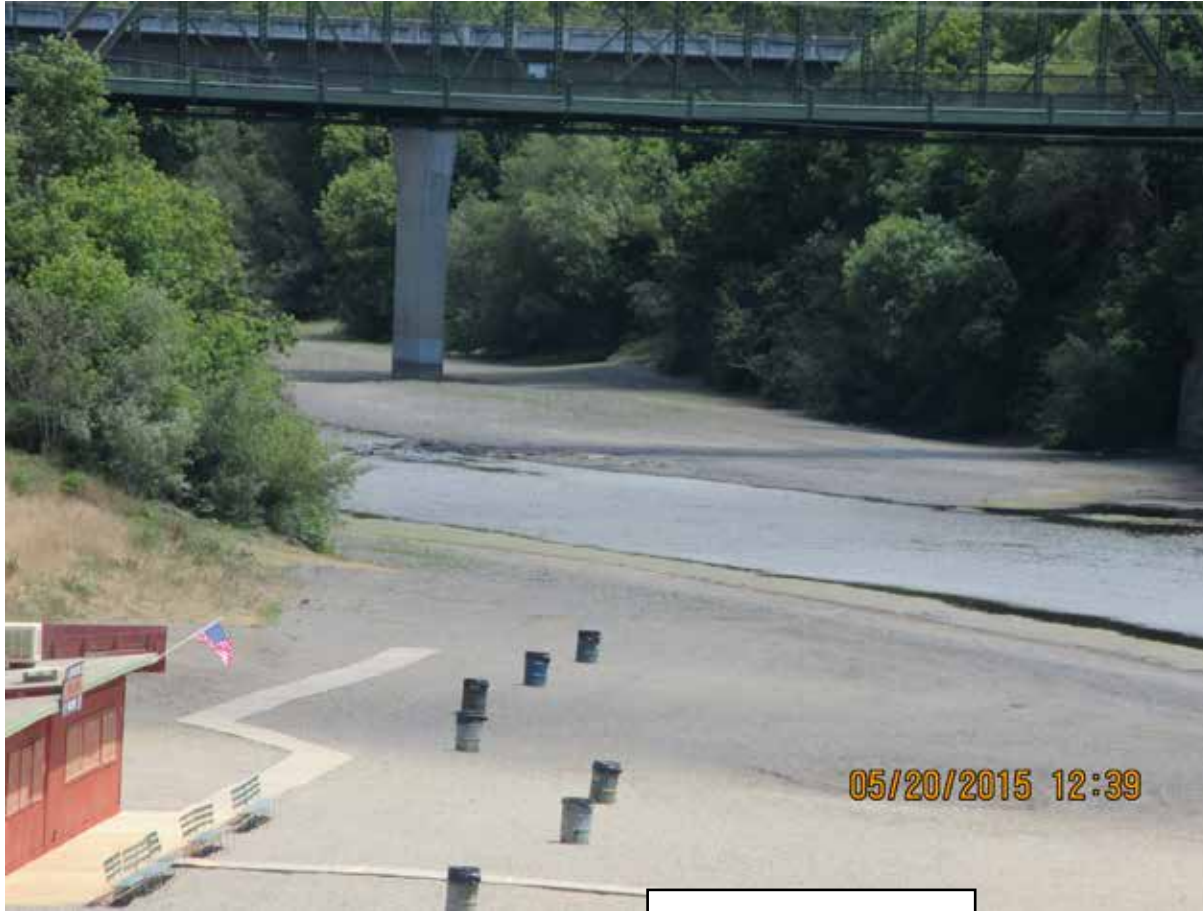
Growth at shoreline